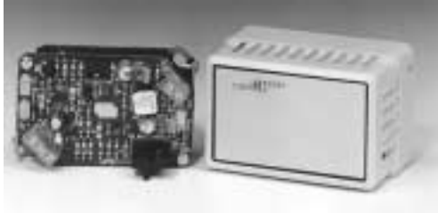
HE-67xx-0N0BT Wall Mount