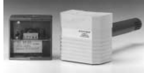
HE-67xx-0N00P Duct Probe